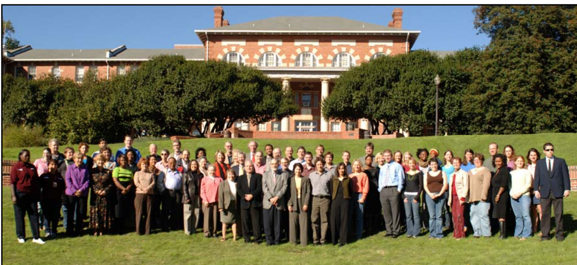
Members of the N.C. State Department of Sociology and Anthropology gather in front of The 1911 Building, their campus home, to celebrate the department's 85 th anniversary.