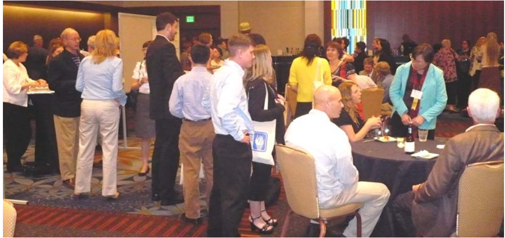
Enjoying the Presidential Reception