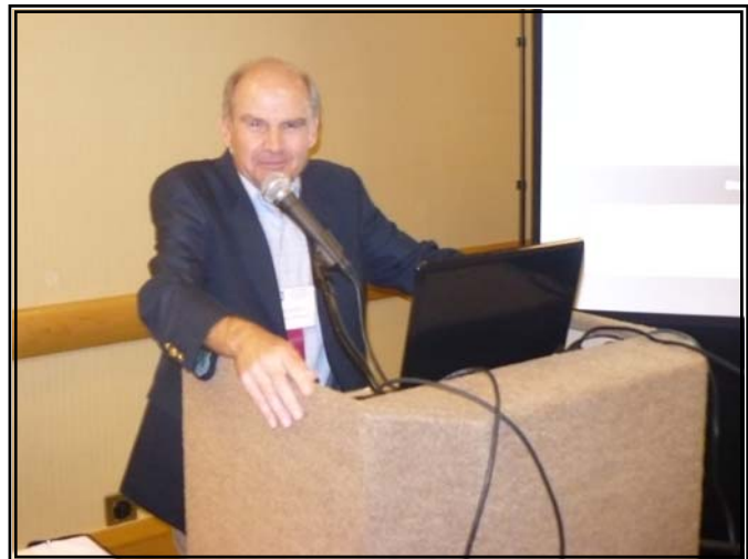
Evelyn Nakano Glenn and George Ritzer deliver plenary addresses.