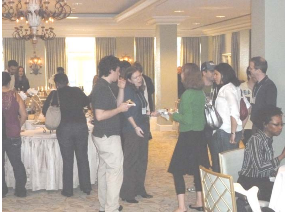
Enjoying the Presidential Reception