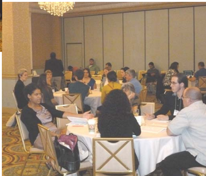
Sharing scholarship at roundtables