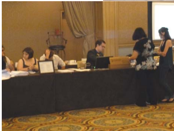
The Registration Desk